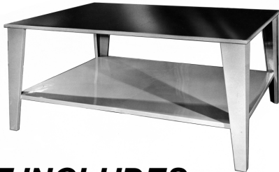
Table Top covered with non-skid rubber