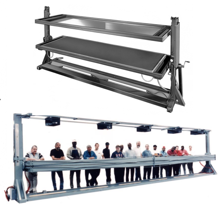
Customized Models Available Single or Double Sided